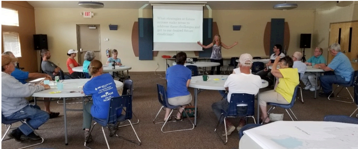
Above: Community members gathered in Onamia for one of the meetings that kicked off the watershed planning process.

Your participation will help insure that the plan represents all the interests of the many individuals and communities who share the Rum River Watershed.